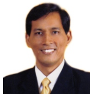
Go, Ronald C. Car Rentals