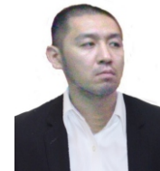
Miyake, Ichido Computer IT Consultancy Spouse: Princess