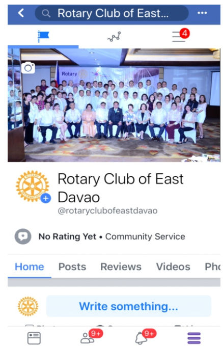
Kindly add our NEW FACEBOOK PAGE @Rotaryclubofeastdavao

Thanks as well to our members who helped, donated and participated in the recent major floods in Brgy. Talomo area. We pray for the continued safety of the victims and thank the Lord that no lives were lost.