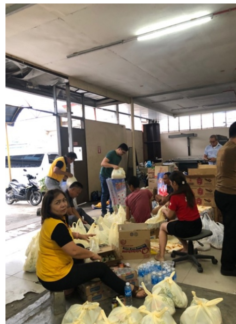
August 30, 2019 Various volunteers done the repacking of the relief goods - Donated to the flood victims at Brgy. Talamo... Area 2 Clubs In action...