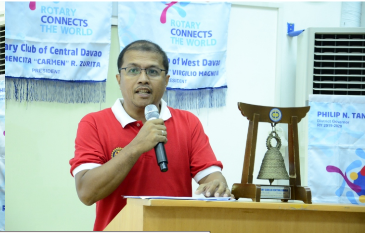
August 31, 2019 Joint Meeting for Area 2C Clubs held at Emcor Davao..